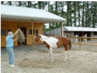
JIMINEE - 2007 Paint/