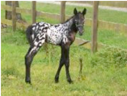
AVATAR - 2008

2007 Knabstrupper gelding, black. Should mature 16h. Laid back personality. Handled daily since birth. Very nice Sport Horse prospect. $8500. Angela Stanaway (804)758-2225