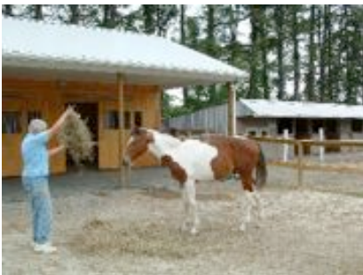
JIMINEE - 2007 Paint/