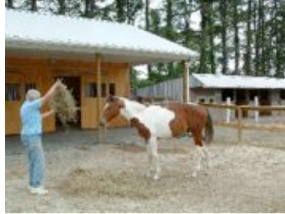
JIMINEE - 2007 Paint/

2007 Knabstrupper gelding, black. Should mature 16h. Laid back personality. Handled daily since birth. Very nice Sport Horse prospect. $8500. Angela Stanaway (804)758-2225