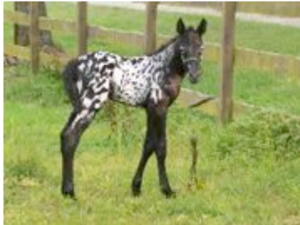
AVATAR - 2008

human circumstance, Ashi is up for sale. Holsteiner, 6 years old and a tall 17.3 hands, though he has no idea that he is a big horse. He's not pushy or aggressive at all; he's quite gentle and very respectful of people. Professionally broke to ride last year in May. Ashi has three solid gaits and was learning leg yields and shoulder in. He lunges with side reins and also line lines. Just introduced to cavaletti. He stands quietly for the farrier and vet. He loads in a trailer and clips easily. Easy keeper. Wonderful personality. Currently living in Michigan. $23,000. Video link: http://video.google.com/videoplay?docid=971202928732016863