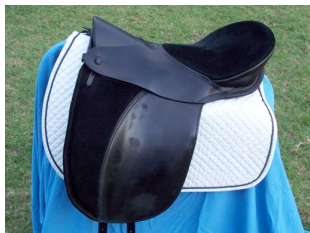
SADDLE FOR SALE: Black

ANSUR Saddles now have a more traditional look! We now have "The Elite", a hunter jumper saddle as well as the dressage and eventing lines. Schedule your Ansur Saddle test ride on your horse with Charlotte Kaspareck at 757- 566-4777 or e-mail: ckaspareck@hotmail.com . Check the website for photos and prices: http://www.ansursaddle.com